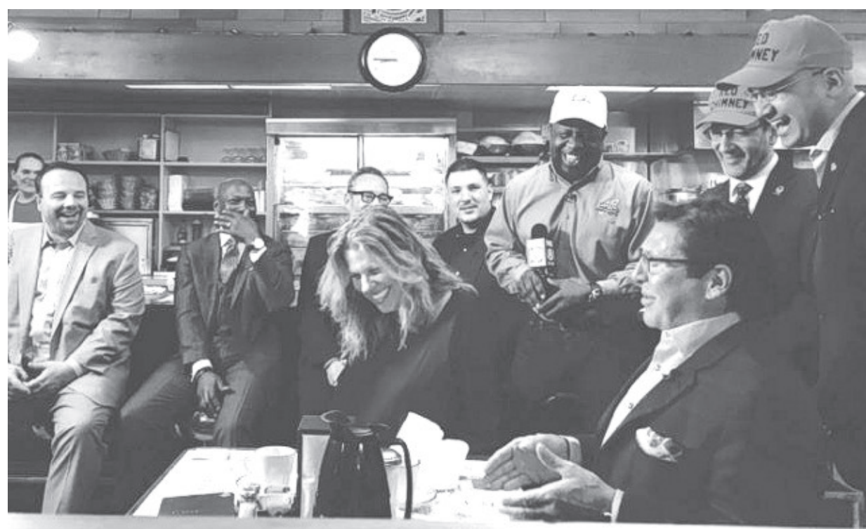
On making the announcement Friday morning that Slavic Village had been chosen as winner of the Cleveland Chain Reaction contest on his "Kickin' It With Kenny" show, FOX 8 personality Kenny Crumpton (holding microphone) visited The Red Chimney restaurant on Fleet Avenue (shown in photo) as well as Inca Tea on Union.

Departments will be open as collection spots for unused medicines from 10 a.m. to 2 p.m. For more information or locations, call 800-882-9539.