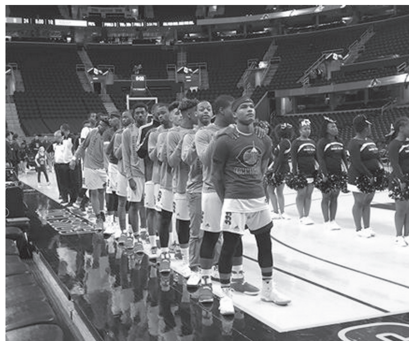
Cleveland Central Catholic Ironmen and cheerleaders on the court at The Q.

The Cleveland Central Catholic High School Ironmen boys basketball team staged a thrilling 64-62 upset victory over the